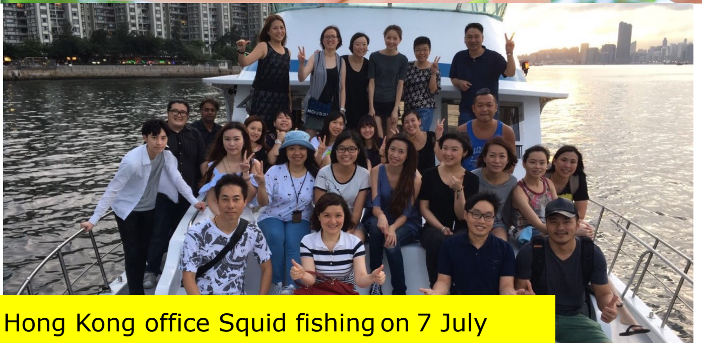
Hong Kong office Squid fishing on 7 July 7月7日香港办事处钓墨鱼活动