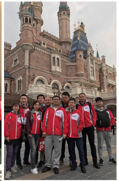
Upper China Gathering in Shanghai Disneyland UC 同事畅游上海迪士尼乐园