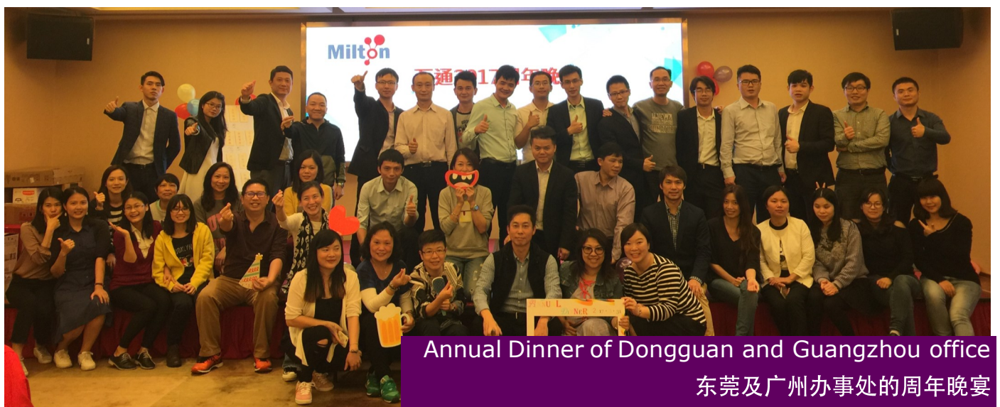
Annual Dinner of Dongguan and Guangzhou office 东莞及广州办事处的周年晚宴