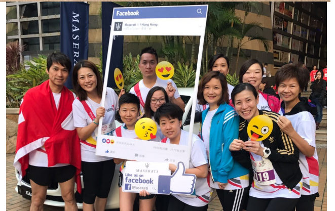
The 10th "旭茉 JESSICA Run" on 2nd April 2017