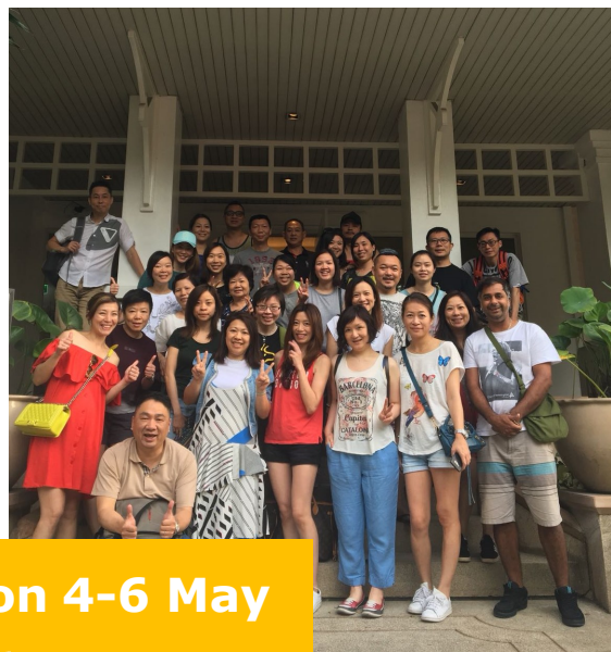
HK Office Annual Trip to Bangkok on 4-6 May 5月4-6日香港办公室周年旅游 - 泰轻松